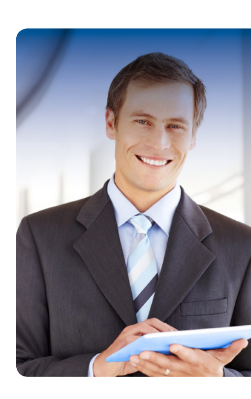
eKiosk runs on Windows*, Apple* iPad or Android* tablet computers and allows visitors to use a familiar touch screen interface to quickly register, print out their own badges upon check in, and notify your employees or tenants of their arrival.

Greater functionality can be achieved when EasyLobby SVM Self Registration or eKiosk is used in conjunction with the EasyLobby eAdvance pre-registration software. The host employee or tenant simply pre-registers the visitor in EasyLobby eAdvance from their own computer, which then sends the visitor a confirmation email with the visitor's registration number. Then, when visitors arrive and are handed an EasyLobby eKioskenabled tablet, they can simply enter their name or registration number to have their visitor record automatically appear on the screen. From there, a visitor badge can then be printed at the Guard station using the EasyLobby SVM main application.