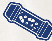
Pharmacy Pneumatic Tubes