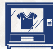
Automated Healthcare Scrub Distribution