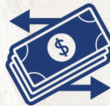
Financial Transaction Processing