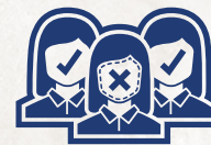
Continual Education / Meeting Attendance