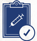
Recording Health Care Employee Vaccinations