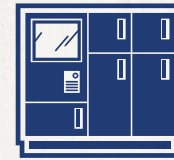
Secure Parcel Lockers