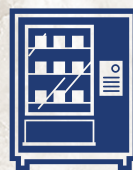
Vending Machine Usage