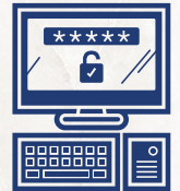
Logical Access / Single Sign-On