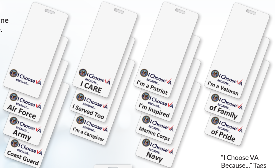
"I Choose VA Because..." Tags